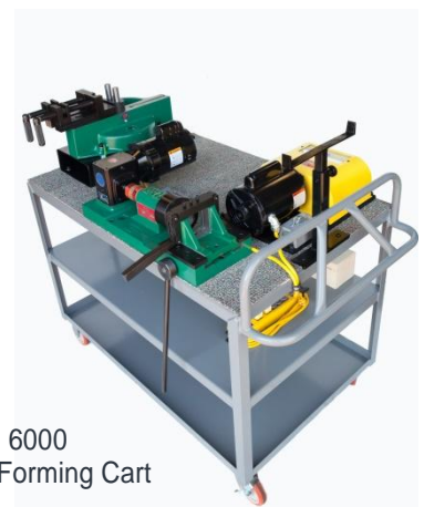
Model 6000 Tube Forming Cart