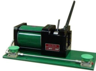
Standard Model 20