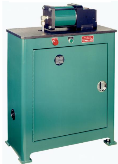
Model 20 Semiautomatic