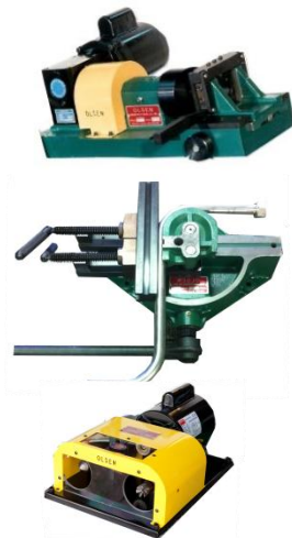
Model 50 PowerFlare